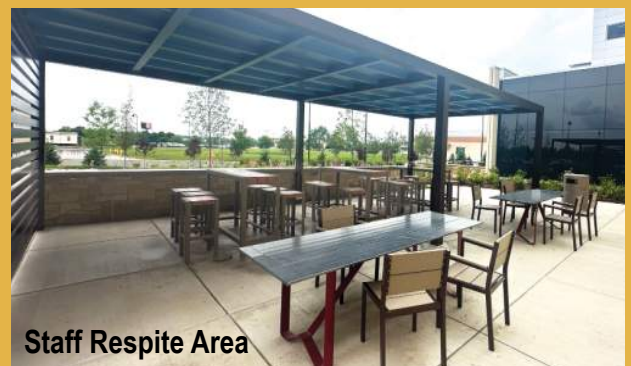
Staff Respite Area